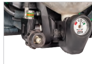
Threaded remote connection

1 Low profile version of the 45-minute, 4500 psig cylinder