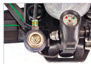
Quick-connect remote connection

2 Low profile version of the 45-minute, 4500 psig cylinder